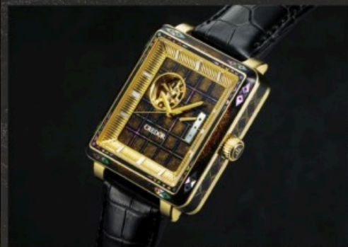
Above: Yongbok Jun's Collaboration with Japanese watch company SEIKO sold for approximately $500,000 USD

Beyond its visual attributes, natural lacquer's antibacterial properties make it particularly suitable for use in items that require hygiene, such as utensils and storage containers. The urushiol compound in the lacquer has been scientifically proven to inhibit bacterial growth, making it both a practical and beautiful choice in art and everyday objects. This dual function of preserving beauty and ensuring safety highlights the unique role of natural lacquer in both traditional and contemporary East Asian art.