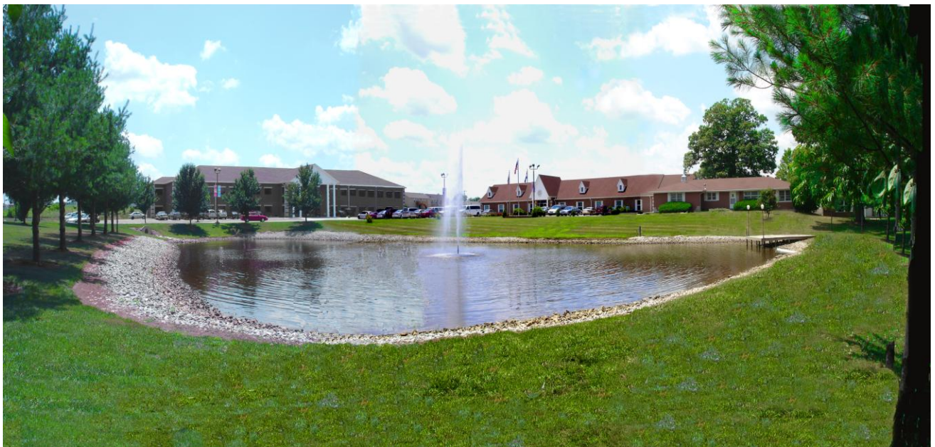
Midwest University Campus- Wentzville, Missouri