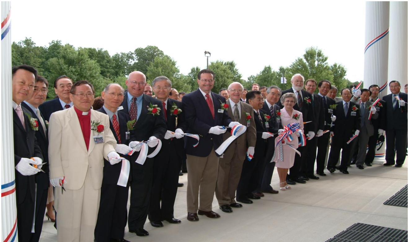
Dedication ceremony for Dr. Jin Kyung Chung Memorial Building-2004