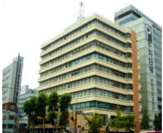
Seoul, Korea Office