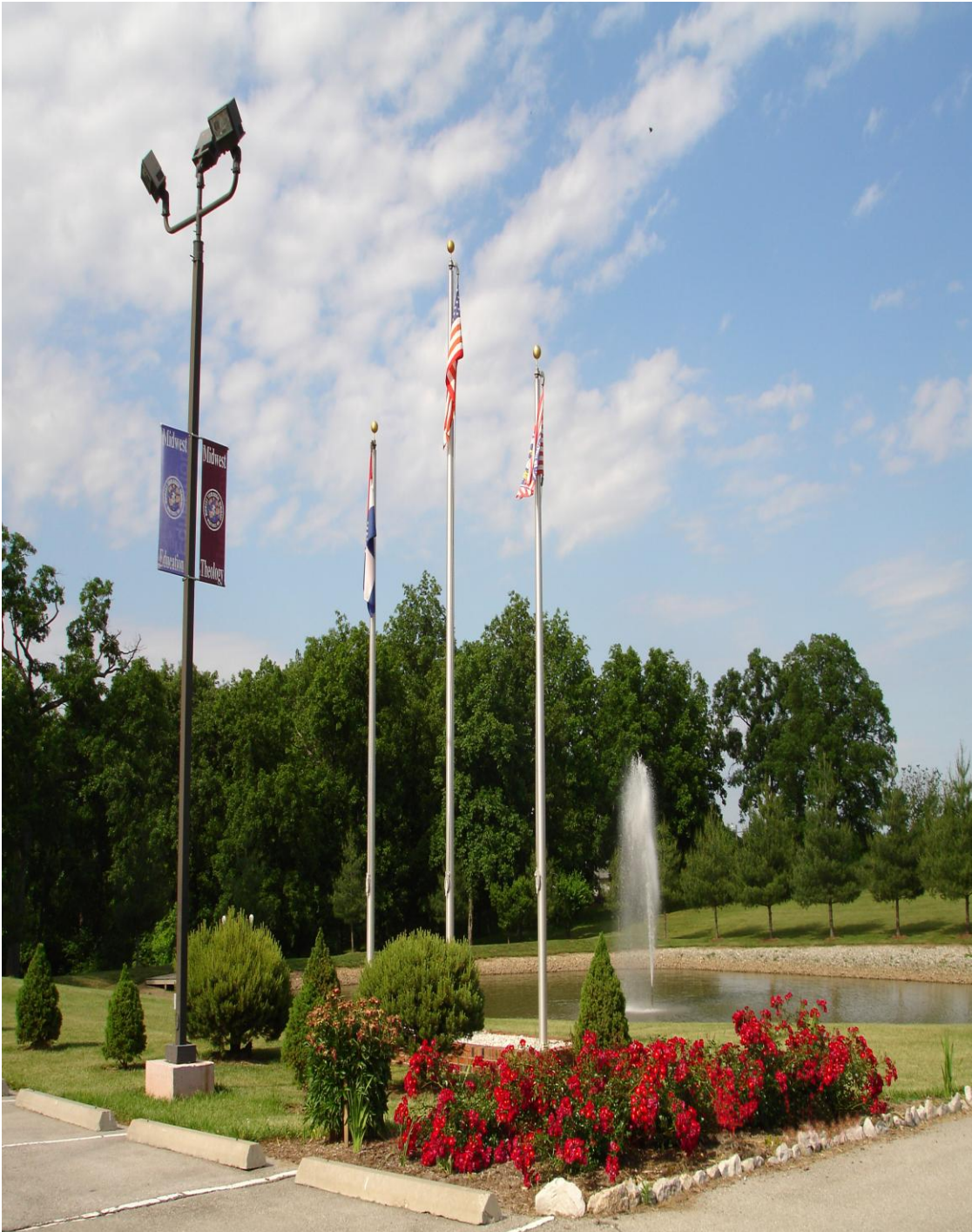
Midwest University Campus-Wentzville, Missouri