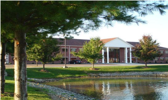
Main Campus-Wentzville, Missouri -U.S.A.

If traveling I-70 west, take Exit 212, turn right onto Route A. Travel west approximately two miles, and make a right turn on Parr Road. From I-40-61, take Route A (Wentzville Parkway) exit, and travel east approximately 1 mile. Turn left on Parr Road. Midwest is approximately ½ mile down Parr Road, on the left (west) side.