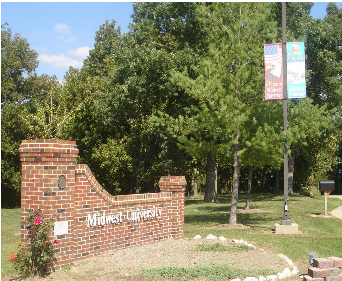
Wentzville, Missouri Campus

On November 3, 2009, Midwest University was granted reaffirmation by TRACS.