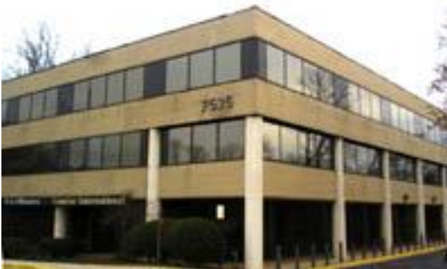
Washington D.C Site , U.S.A