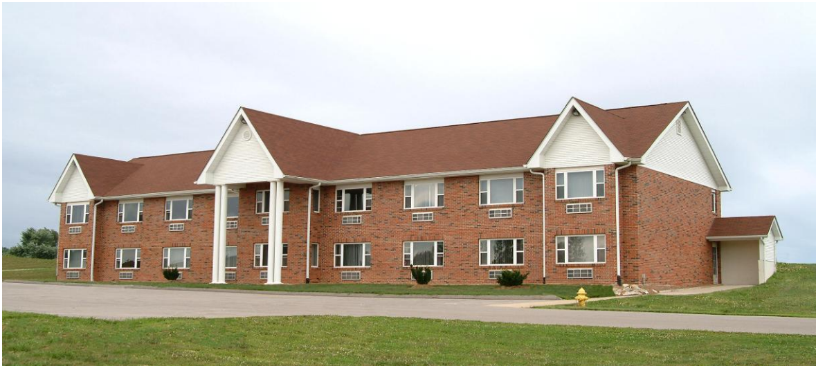
Midwest University-Main Campus Residence Hall

For further information regarding Midwest's on-campus housing or help in relocating to the St. Louis area, you may contact Midwest's Business Office by e-mail at usa@midwest.edu or by calling (636) 327-4645 and ask to speak with the director of the Business Office.