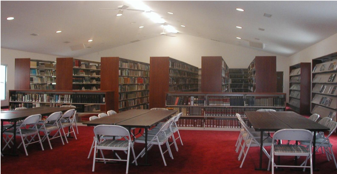
Midwest University-Main Campus Library

A professional librarian coordinates library activities with the library staff and serves both resident and off-campus students. Materials that circulate will be sent to students upon request regardless of the student's location. The librarian can be contacted via e-mail at library@midwest.edu or by contacting Midwest University.