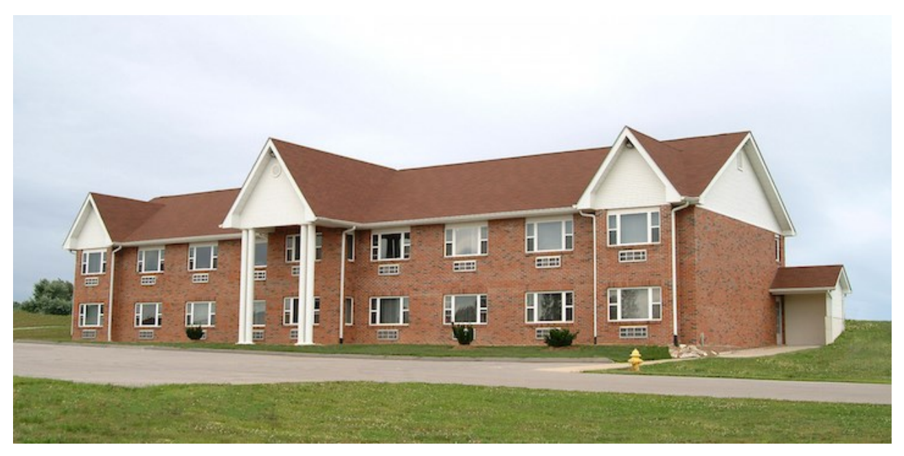
Midwest University Residence Hall