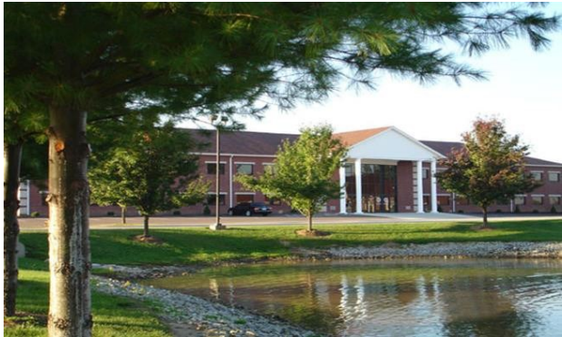
Main Campus-Wentzville, Missouri -U.S.A.