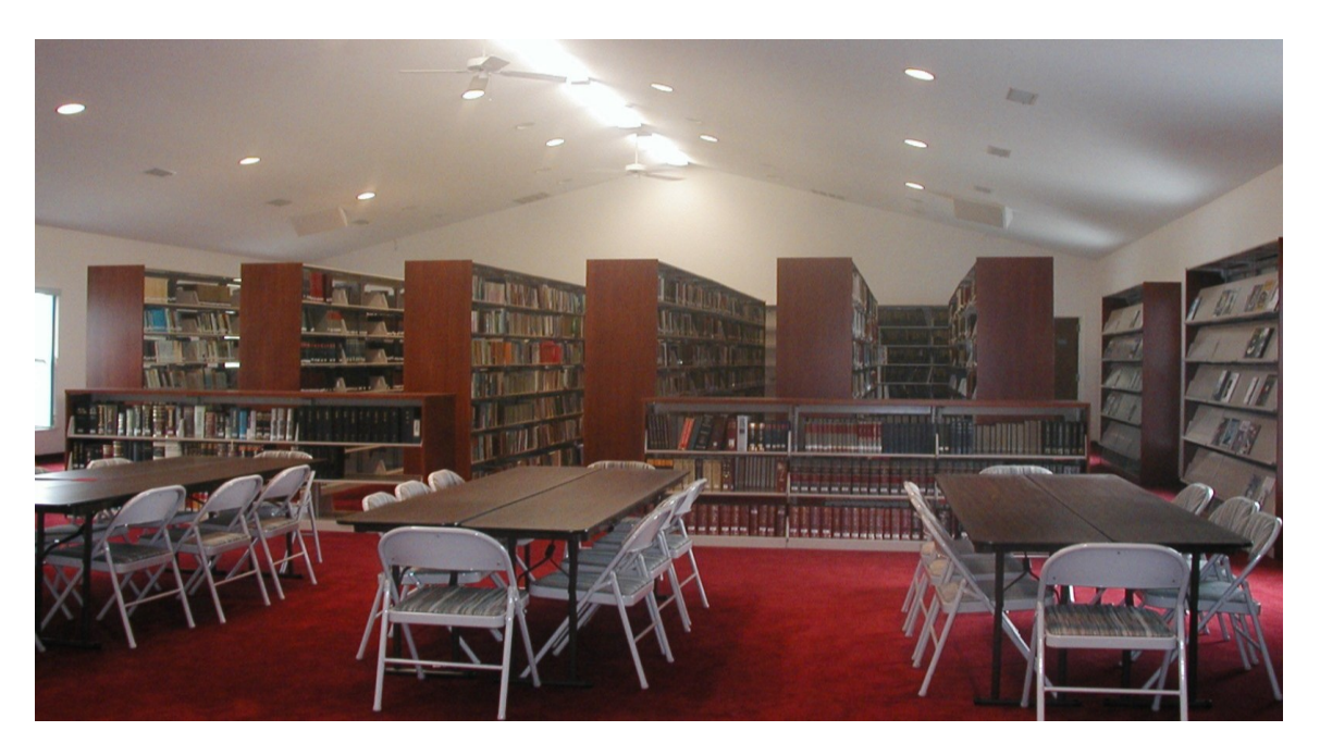
Midwest University-Main Campus Library

A qualified librarian coordinates library activities with the library staff and serves both resident and off-campus students. Materials that circulate will be sent to students upon request regardless of the student's location. The librarian can be contacted via e-mail at library@midwest.edu or by contacting Midwest University