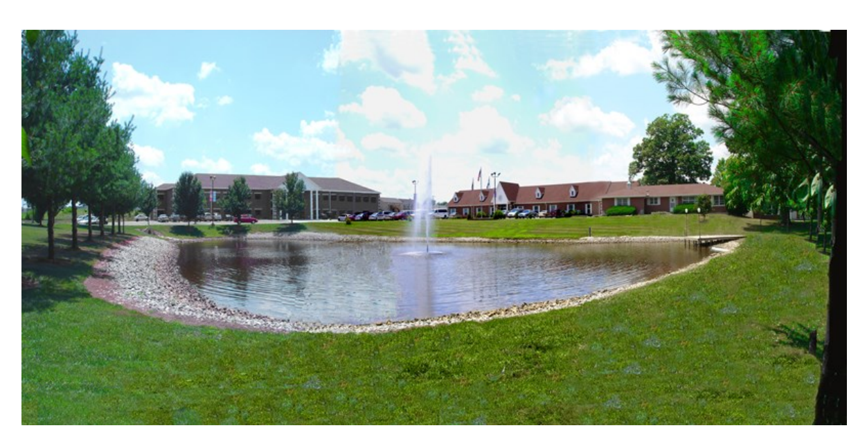
Midwest University Campus - Wentzville, Missouri