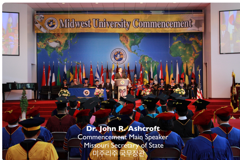
Dr. John R. Ashcroft Commencement Main Speaker Missouri Secretary of State 미주리주 국무장관